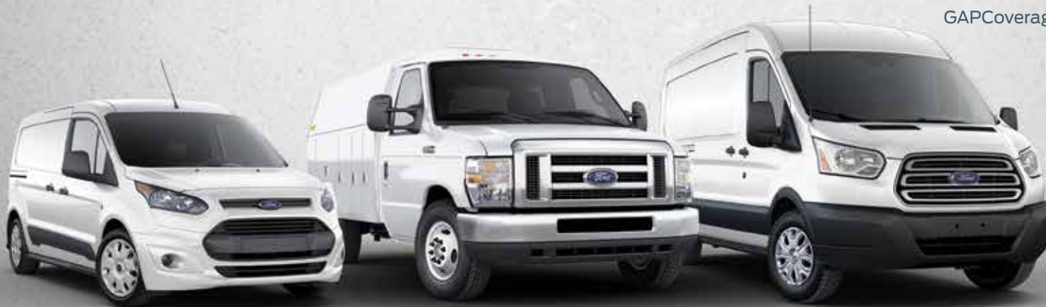
Vehicles shown with aftermarket equipment.

Additional limitations apply. Be sure to review all limitations outlined in your Commercial GAPCoverage addendum.