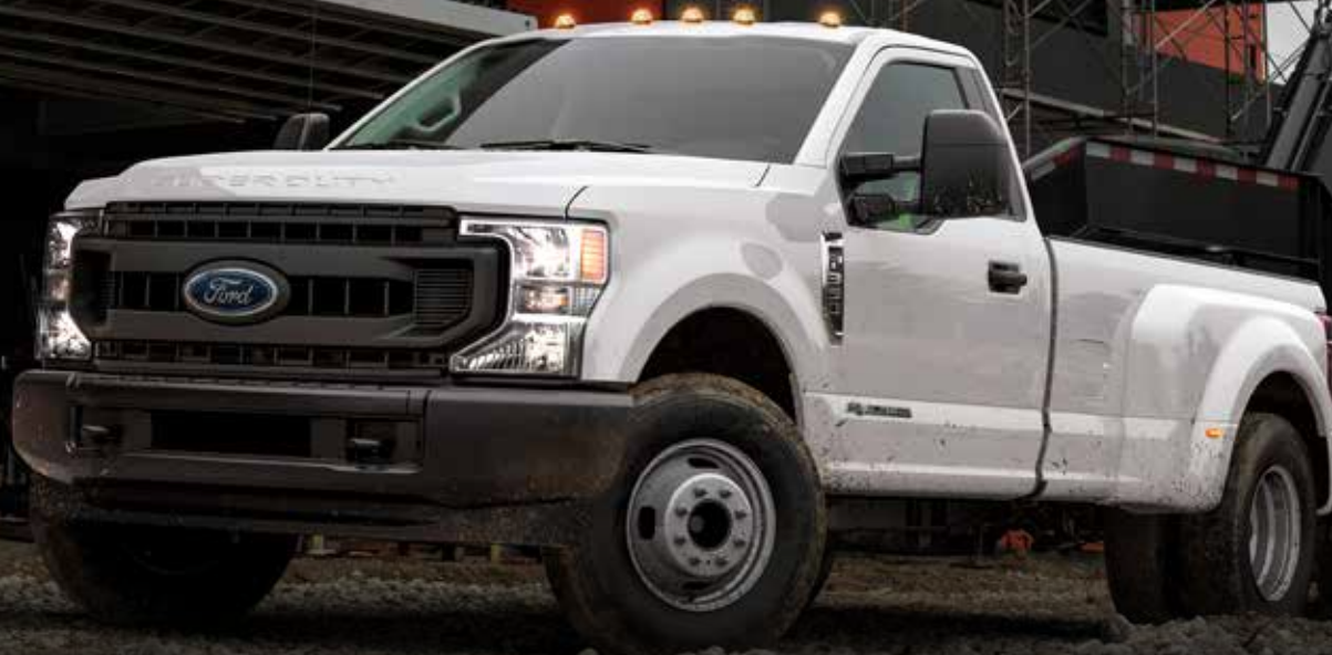
F-350 XL Regular Cab 4x2 with 6.7L V8 Turbo Diesel in Oxford White

Horsepower and torque are independent attributes and may not be achieved simultaneously.