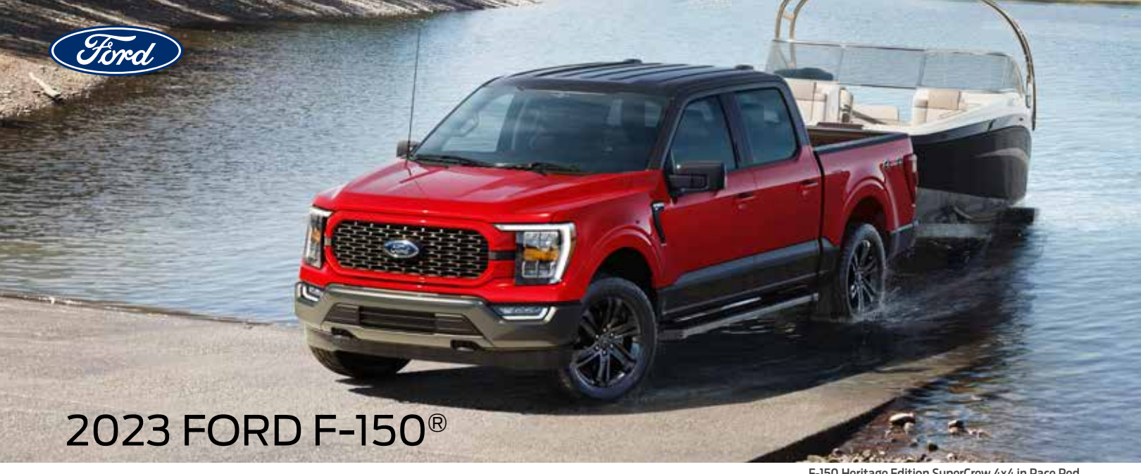
F-150 Heritage Edition SuperCrew 4x4 in Race Red