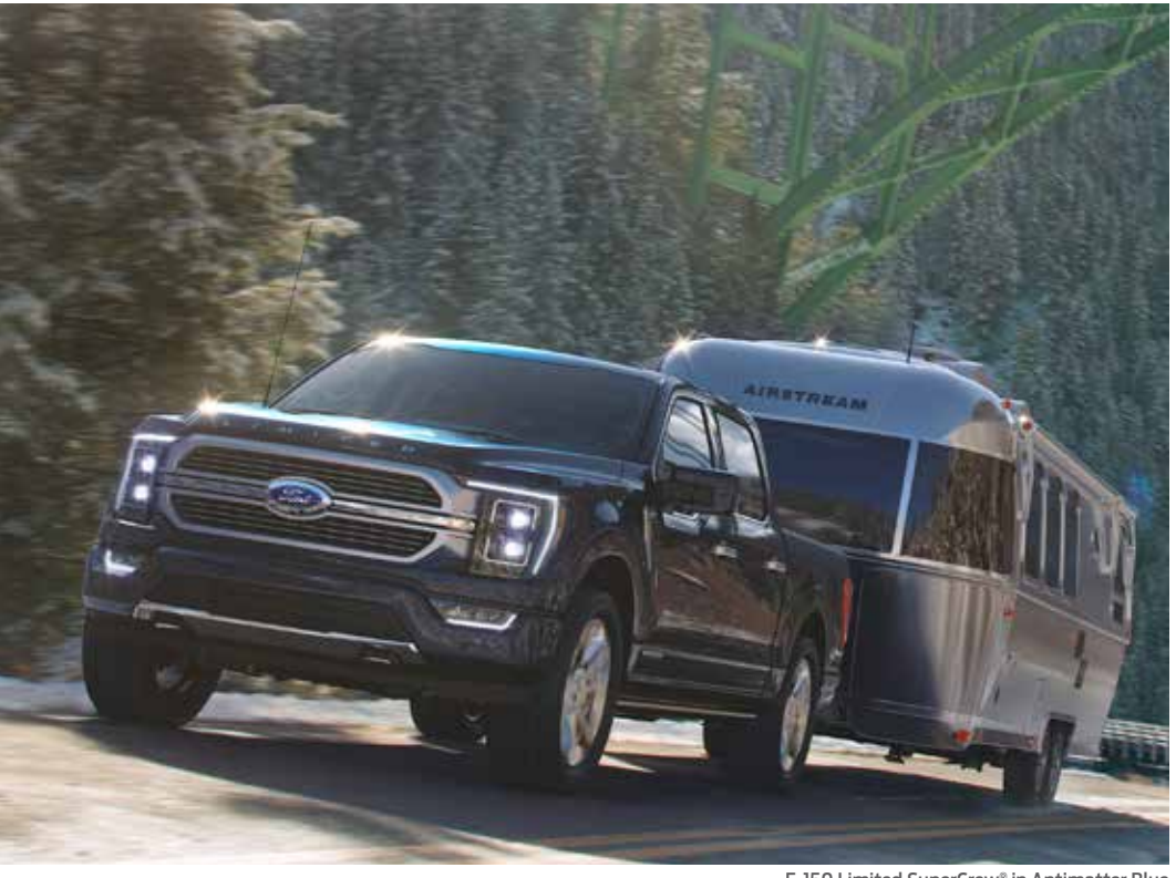
F-150 Limited SuperCrew® in Antimatter Blue

Combining exceptional strength, capability and intelligent technology, the 2023 F-150 is a true workhorse capable of handling the toughest jobs. A high-strength steel frame and military-grade aluminum alloy body are BUILT FORD TOUGH® to help F-150 achieve impressive towing and payload ratings.