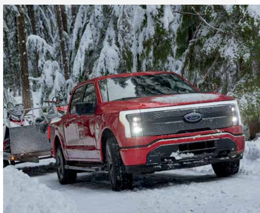
F-150 Lightning SuperCrew XL 4x4 in Rapid Red