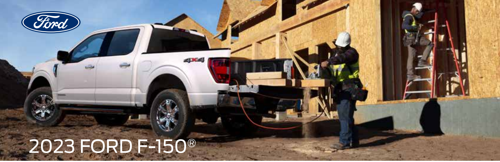
F-150 XLT SuperCrew 4x4 with Chrome Appearance Package in Oxford White