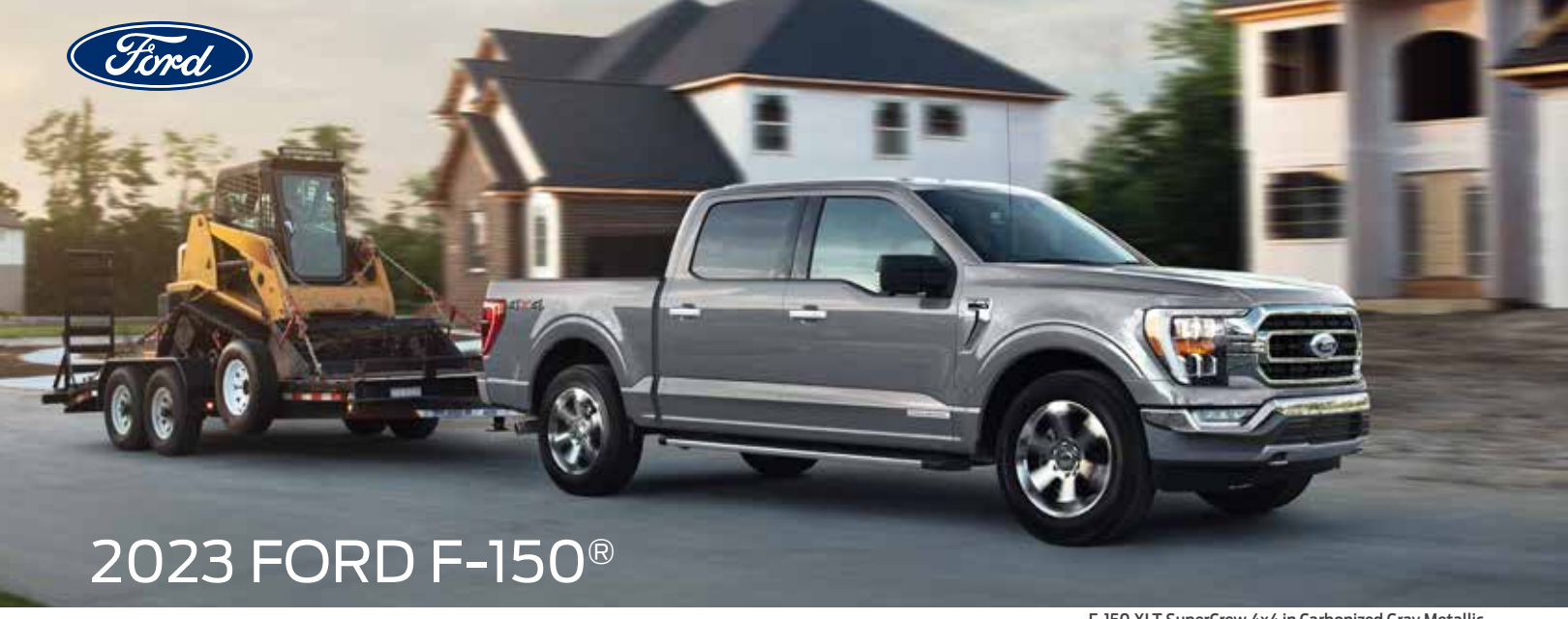
F-150 XLT SuperCrew 4x4 in Carbonized Gray Metallic