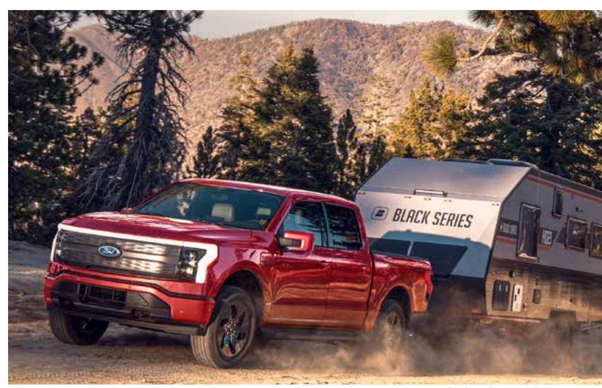
F-150 Lightning LARIAT SuperCrew® 4x4 in Rapid Red Metallic Tinted Clearcoat