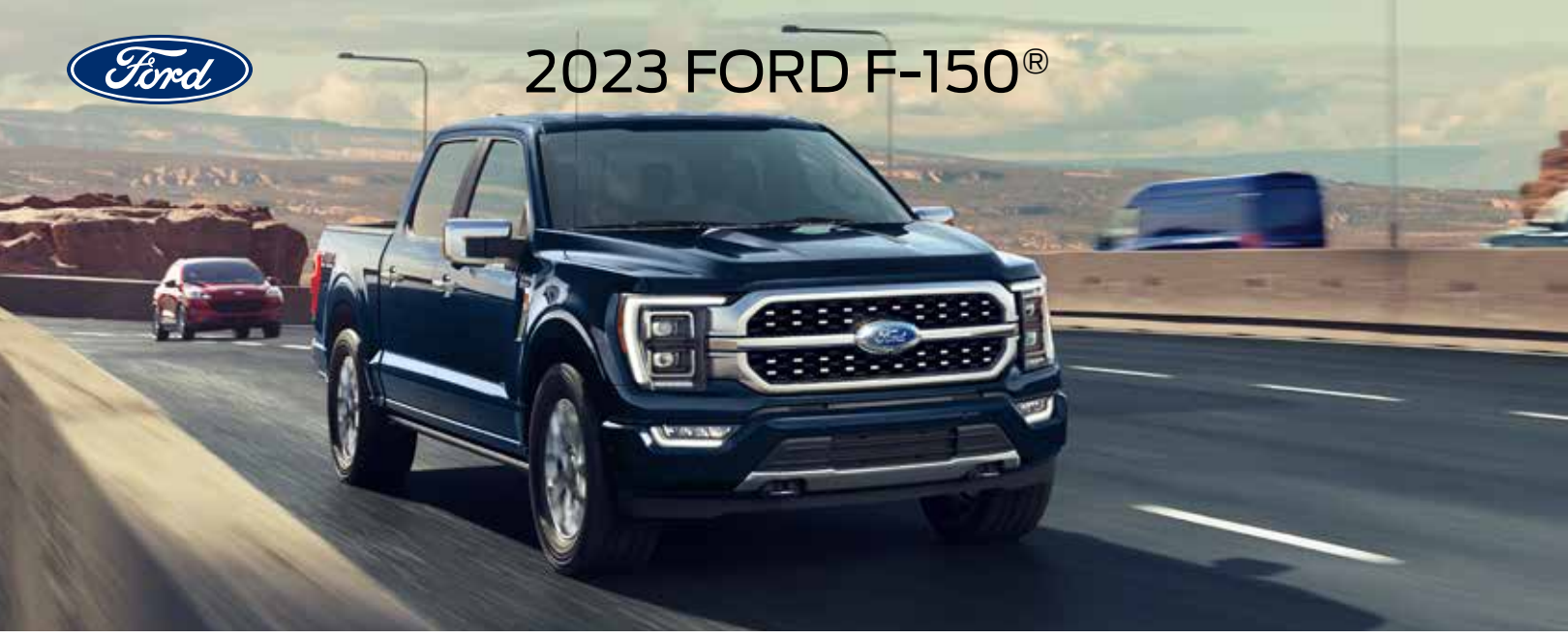
F-150 Platinum SuperCrew 4x4 in Antimatter Blue