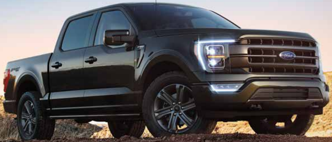
F-150 Lariat SuperCrew® 4x4 with Sport Appearance Package in Agate Black Metallic