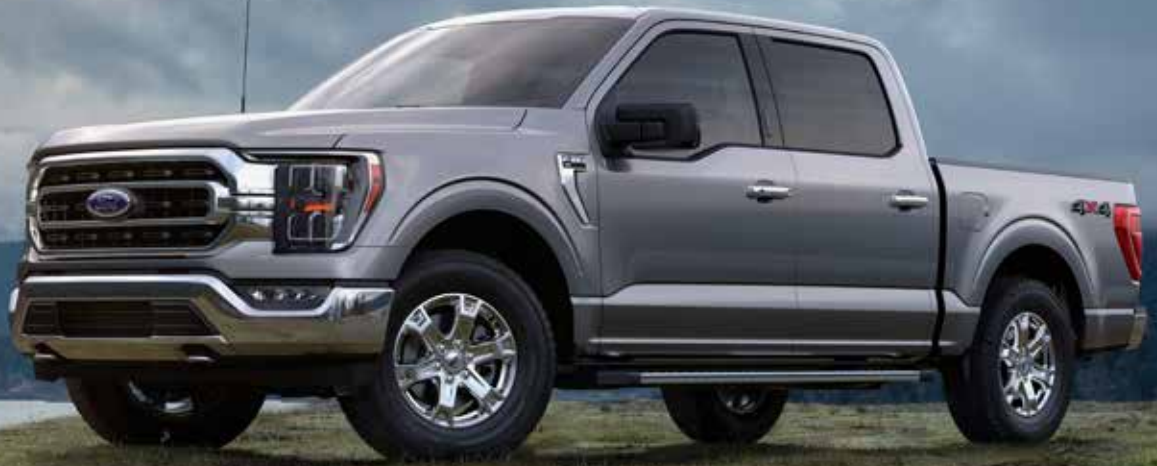
F-150 XLT SuperCrew 4x4 with Chrome Appearance Package in Iconic Silver Metallic