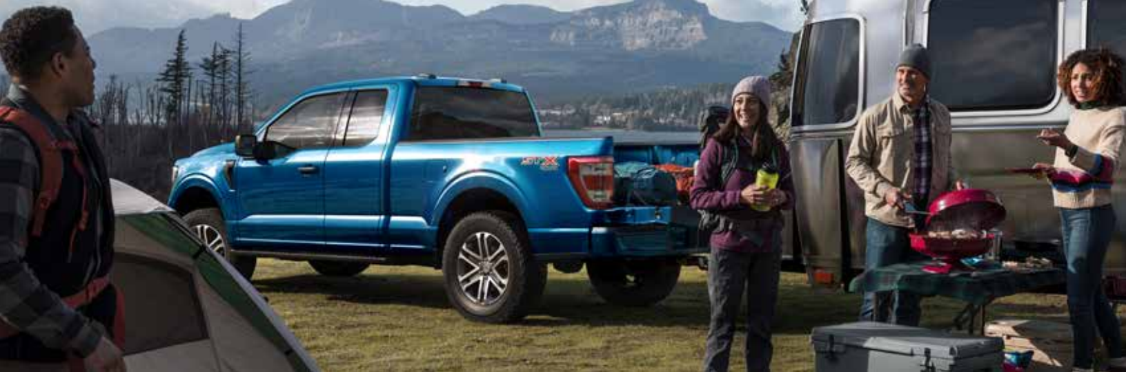
F-150 STX SuperCab 4x4 in Velocity Blue Metallic