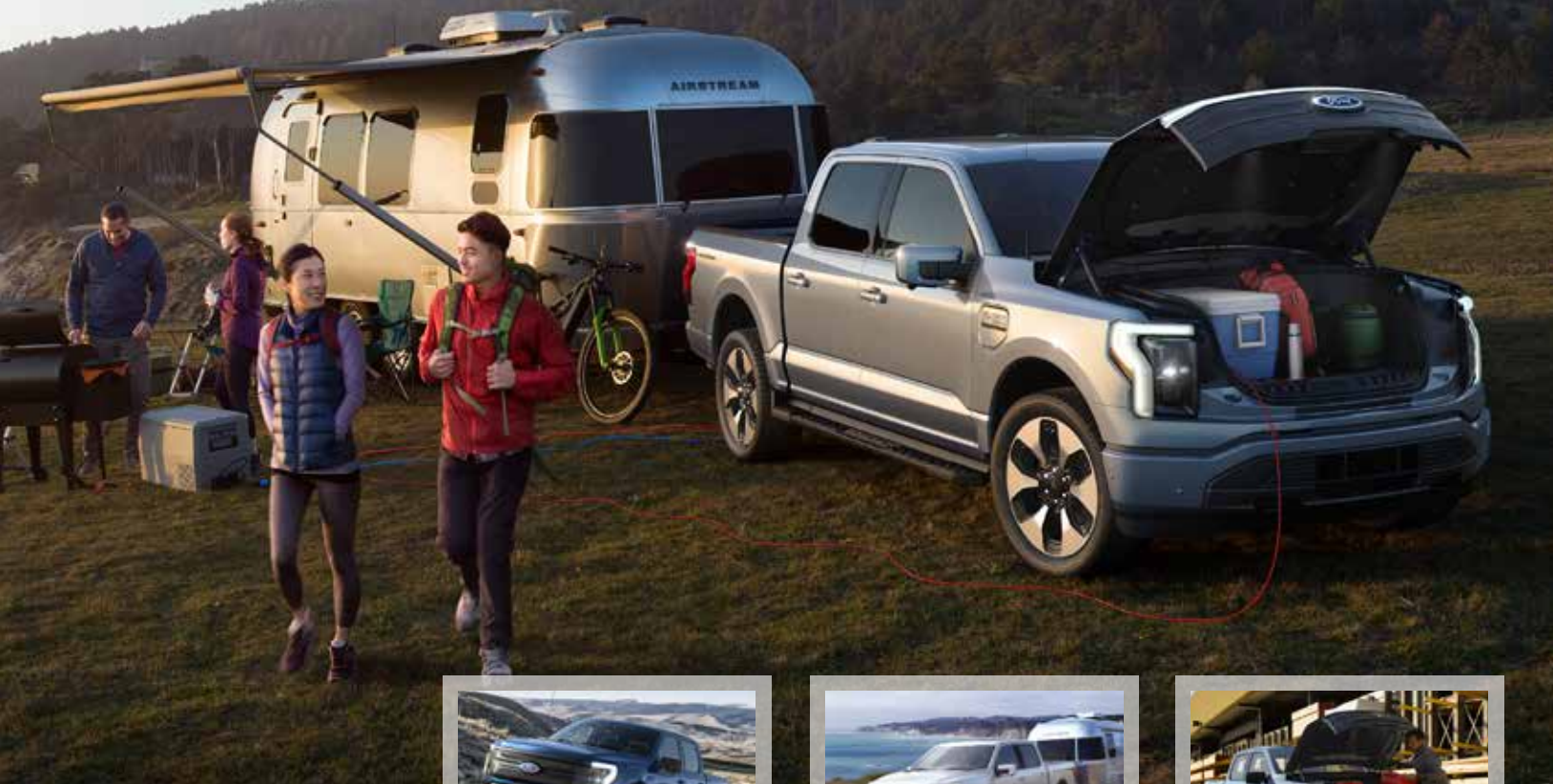
F-150 Lightning vehicles shown are pre-production models