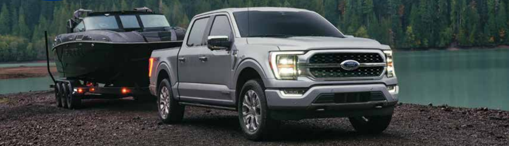
F-150 Platinum SuperCrew 4x4 in Iconic Silver Metallic