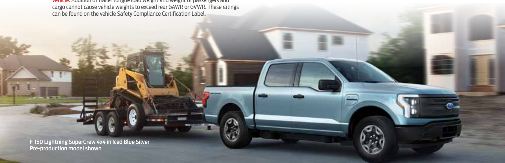
F-150 Lightning SuperCrew 4x4 in Iced Blue Silver Pre-production model shown

Note: Maximum tailgate height will vary based upon vehicle configuration, option content and tire size.