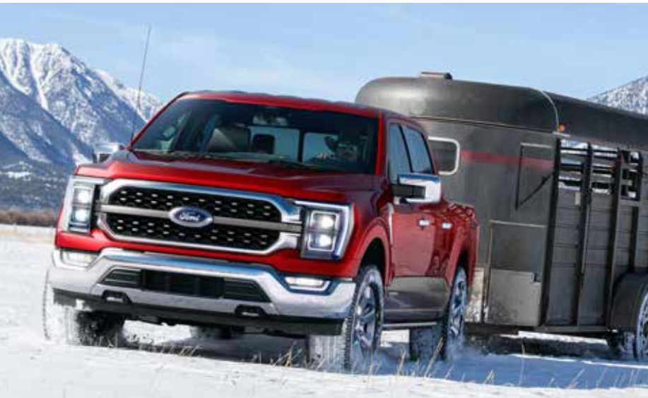
F-150 SuperCrew® 4x4 with Chrome Appearance Package in Rapid Red Metallic Tinted Clearcoat