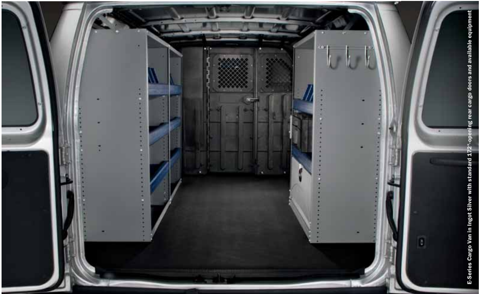
E-Series Cargo Van in Ingot Silver with standard 172°-opening rear cargo doors and available equipment

A wide range of available STORAGE SOLUTIONS by Masterack® can help keep you organized. There's the QUIETFLEX® COMPOSITE racks and bins package, the rugged MASTERACK® STEEL racks and bins package, and the ECONOCARGO® Cargo Management System – all AVAILABLE AT NO EXTRA CHARGE ¹