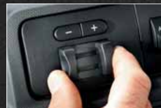
FACTORY-INTEGRATED TRAILER BRAKE CONTROLLER OPTION

AdvanceTrac® with class-exclusive RSC® (Roll Stability Control) 4 is standard on all E-Series Vans and Wagons this year. Working in conjunction with the Anti-Lock Brake System (ABS), traction control and yaw control, the system automatically determines when and how to apply individual brakes and modify engine power to help keep all 4 wheels firmly planted.