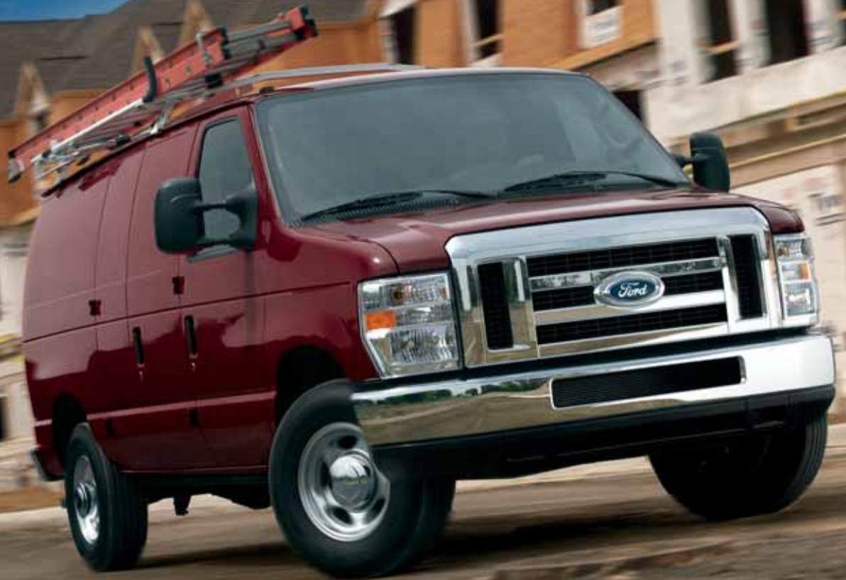
E-250 Cargo Van in Royal Red with available and aftermarket equipment