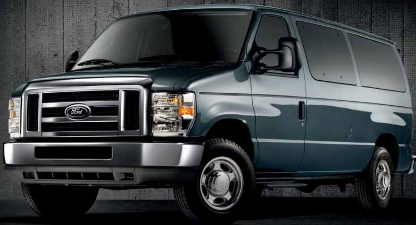
E-150 XLT Premium 7-passenger Wagon in Steel Blue with available equipment

1 Passenger and cargo capacity limited by weight and weight distribution. 11-, 12-, 14- and 15-passenger vehicles may be classified as buses and may require appropriate licensing.