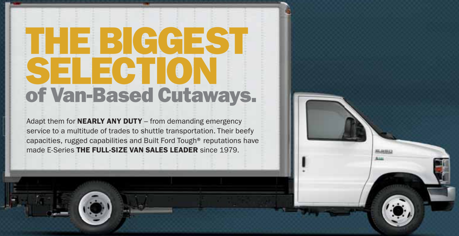
E-350 Cutaway in Oxford White with aftermarket Cube Van Upfit and available equipment

Adapt them for NEARLY ANY DUTY – from demanding emergency service to a multitude of trades to shuttle transportation. Their beefy capacities, rugged capabilities and Built Ford Tough® reputations have made E-Series THE FULL-SIZE VAN SALES LEADER since 1979.