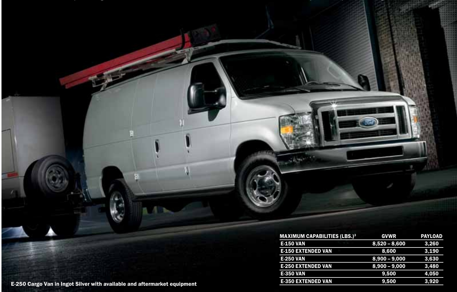
E-250 Cargo Van in Ingot Silver with available and aftermarket equipment

E-Series Vans can help you TOW UP TO 10,000 LBS. 1 with the confidence of SMART TECHNOLOGY like standard Roll Stability Control, TM an available integrated trailer brake controller, available full-color rear view camera and more. Standard DOUBLE-WALL CONSTRUCTION helps protect the outer body from shifting loads so you can HAUL UP TO 278 CU. FT. OF CARGO with peace of mind. Among your choices: 3 engine/transmission combinations including a TorqShift® 5-speed automatic with TOW/HAUL MODE 1 sliding or swing-out side cargo doors, windows all around or panel sides, NO-CHARGE RACKS AND BINS PACKAGES for easy stowing, and TRADE-SPECIFIC UPFITTER PACKAGES 2 E-Series is ready to meet your challenges.