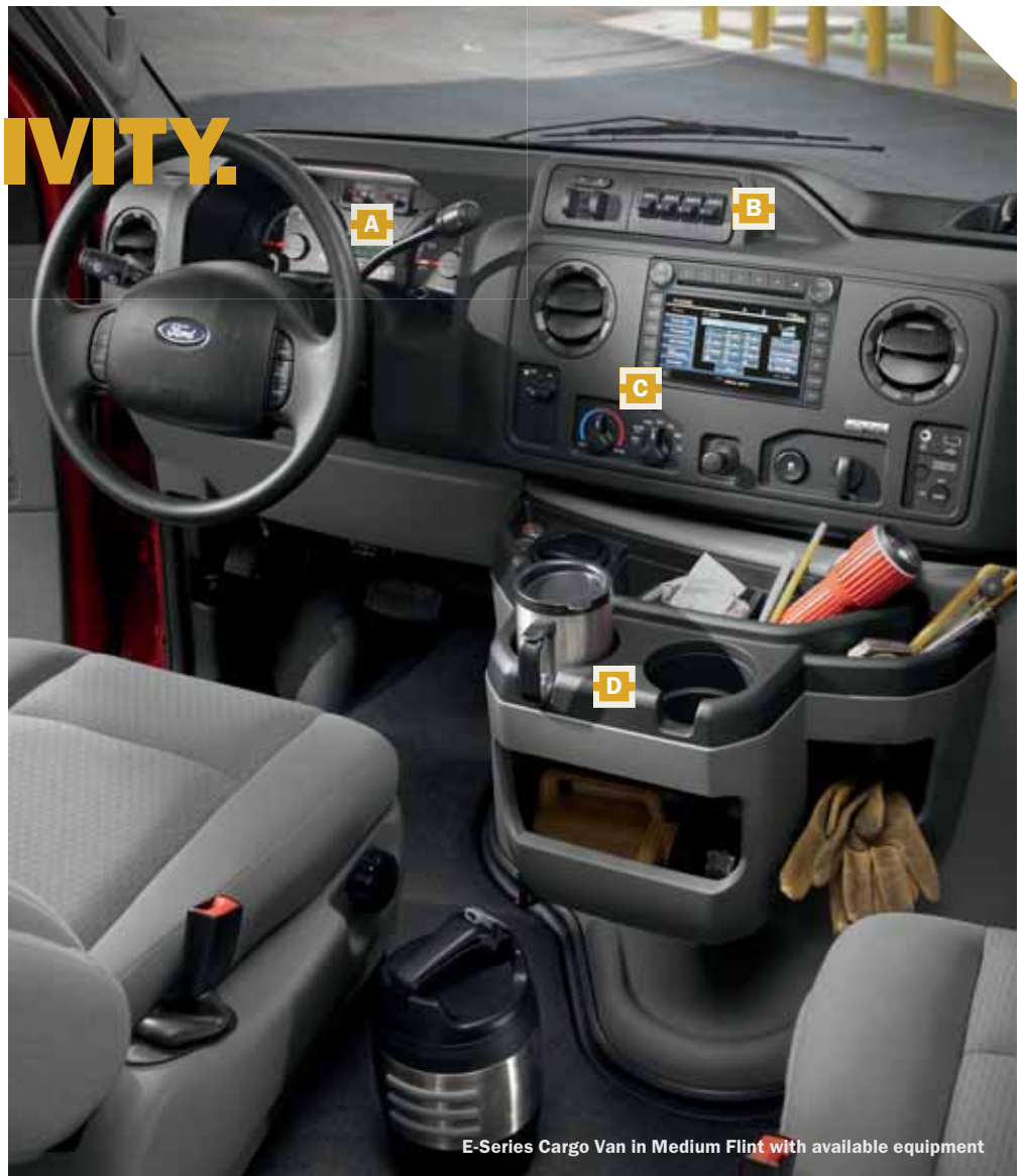
E-Series Cargo Van in Medium Flint with available equipment

This standard feature gives you lots of storage capacity within easy reach. The upright storage bin is large enough to hold clipboards or even some laptops.