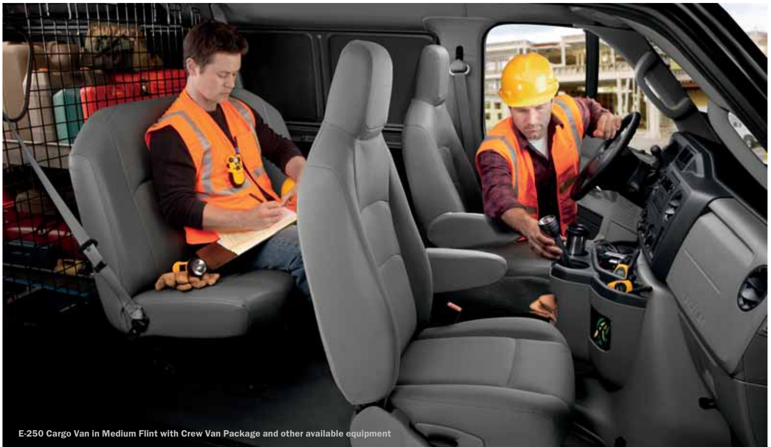
E-250 Cargo Van in Medium Flint with Crew Van Package and other available equipment

Equip your E-Series Cargo Van with the available CREW VAN PACKAGE to carry PEOPLE AND GEAR with ease. Up front, the roomy 2nd-row vinyl bench seat with 3-point, seat-integrated safety belts creates room for a CREW OF UP TO 5 . The seating area is finished similar to that of a Wagon with a partial headliner, full B-pillar trim panels, polypropylene side door-trim panels, a lower trim panel behind the driver's seat, and a convenient pull handle on the 40% portion of the side door. RUGGED VINYL FLOOR COVERING runs throughout the front and rear sections. A sturdy, METAL-MESH BULKHEAD divides the 2 spaces. And the passenger-side rear door gets a pull handle in the cargo area to help make quick work of equipment transfers.